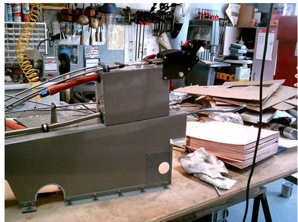
Engine management/fuel and environmental control panel