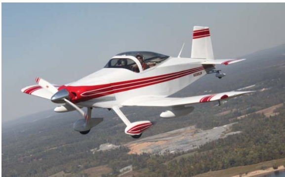
N589LW off the wing of N718DR on return to M34

Looking back on the weekend at Kentucky Dam, it was a fun filled weekend for anybody who has an interest in aviation or likes to look at planes. The area is a peaceful and scenic, the food is good, and the people are probably some the nicest people you will ever meet. From the moment I arrived a shy nervous non-pilot, I felt accepted and as though I had been with the group for the last 22 years. This weekend is all about Friends, Food, Fun, and Flying, if you are in the area or able to make it, I encourage anyone to come join the fun. It isn't just for pilots or builders; it is for anyone that likes a good time with good people.