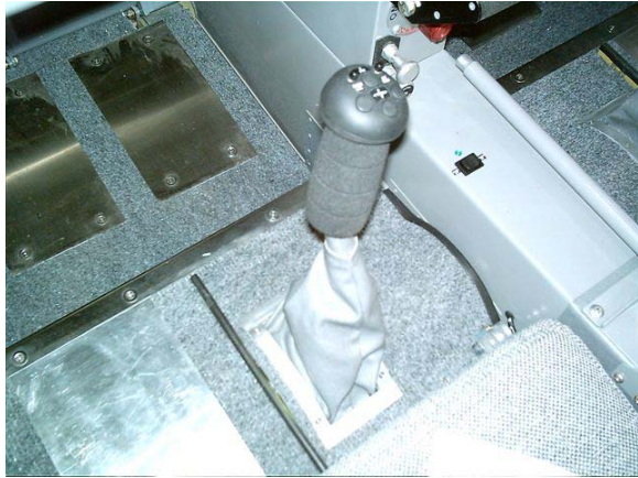
Nice SS on the floor and full use of that Ray Allen stick grip.