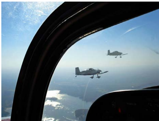
... get an afternoon of formation training from Gary Green and Bob Highley.

There isn't any fuel on the field at Kentucky Dam so everyone fuels up at Murray. The rest of the afternoon is spent flying and socializing. A little after noon the ladies return from town and show off some good buys. The pilots continue to give rides until the sky starts to get dark. The group eats at the dinner buffet at the hotel. People with vehicles start shuttling people back to their rooms to get cleaned up and then we all meet in a private room from dinner.