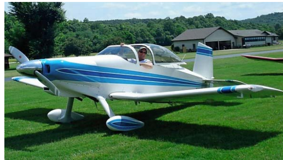
N51863 at "The Valley" June 2010

pilot and started a second career in software development (My BS is in Computer Science/Math). My early years and experience in the corporate aviation world made me appreciate the Thorp and its flying qualities. With this in mind I immediately began the search for a suitable Thorp to rejuvenate. Since then I have restored two Thorps from the ground up, and repaired a couple as well. I'm on my third T-18 project now and do not plan on quitting any time soon! Put short I'm about as big of a Thorp fan as you will find!