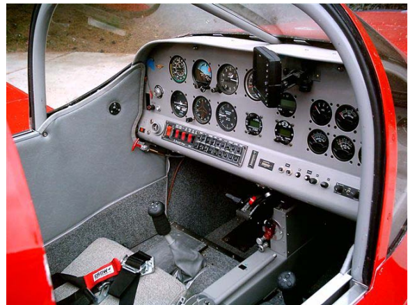
Very well laid out panel including Composite design power panel, (note center controls)