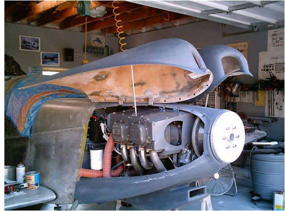
Hinged Cowl cheeks and enclosed engine plenum.