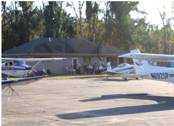
Central Command at KY Dam, the picnic table!