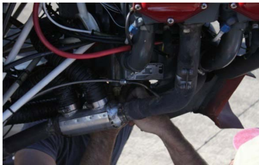
Ahh! There it is.

It was nearly time for us to leave to go down to Murray and we don't want to disappoint the folks there that are always so kind to us so several of the guys headed out after making sure that I would be fine. A few of the others stayed behind to offer support and advice and assist in the repair. We determined that it would be acceptable to wire the mixture arm in the full rich position. After all, we were operating at low altitudes and leaning was not necessary. As is always the case as soon as the cowl started to come off the cameras came out and everyone gathered to look inside. I did not mind at all, I still enjoy looking at how others handled the various challenges in the engine compartment.