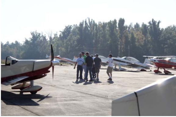
TheOlney/Vincennes group on inspection detail