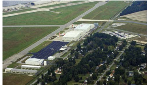
The ramp at Elizabeth City Regional Airport (KECG), let's fill it up!

As we get closer I'll post more info and other weekend activities, to include a spouse program and meal plans. The attached photo shows our ramp and the adjacent DRS and Telephonics facilities on either end. Plenty of room for a ramp full of Thorps!