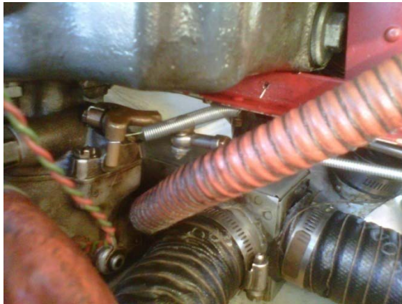
Center of picture is the return spring one end on the mixture arm, the other on the control support.

could have gone bad in more ways than I care to think about. Following some good advice I received that day I have since installed a spring that will pull the mixture arm to the full rich position should it happen again. I simply went to the aviation department of the local farm store and bought the lightest spring they had a couple of inches long. I hooked one end around the stop on the mixture arm and the other end on the brace that holds the end of the sheath of the mixture and throttle cables. This was just a convenient location that would pull the arm full rich without interfering with the operation of the throttle. You wouldn't want to strong of a spring or it might tend to pull the mixture rich during flight. I talked to Bernie Fried since then and he has a similar setup although I think his spring is longer than mine but it pulls at a similar angle.