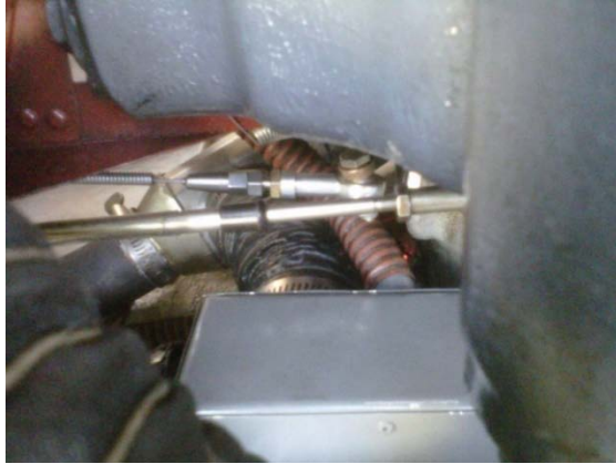
New "Heim" style mixture control.

The heim bearing was #10 but the mixture arm is 1/4" so I put in a bushing to make it tight, then secure with an oversized washer that prevents the arm from dropping off if the bearing fails. Use a #10 bolt and either an all metal stop nut or a castle nut, remember no nylock nuts in the engine compartment. Make sure the assembly moves freely and the mixture arm travels fully through the full range of travel.