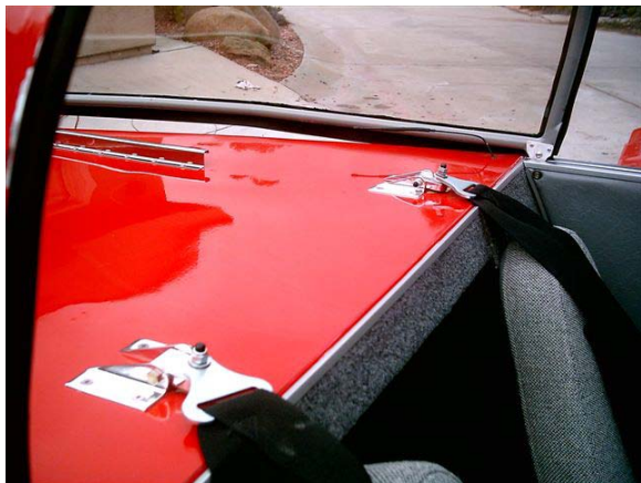
Relocation of the shoulder harness attach points.