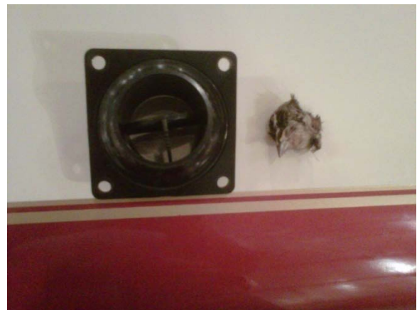
Not a finger puppet, now that's two feathered friends N718DR has taken down!

the cabin heat/cool air mixer box. At first I thought it was a nut that a mouse had carried up in there. Then as I looked closer I determined that it was a bird. A couple of months ago a friend of mine came into the hanger while I was piddling with something and commented "You hit a bird". There were several feathers stuck to the inlet lip of my air scoop. I was not aware I had hit anything. On my plane I combined the carburetor intake and cabin air intake into the same scoop. We couldn't see anything in the K&N air filter or down the cabin air duct. When I removed the vent I found only the bird head so I assume the rest of him must have gone outside of the scoop. The good news is it did not damage anything and I never smelled him either. This is not related to the bird strike I had about a month later that dented the leading edge in the center of my right outer panel. Not bad enough to affect performance but enough to be ugly.