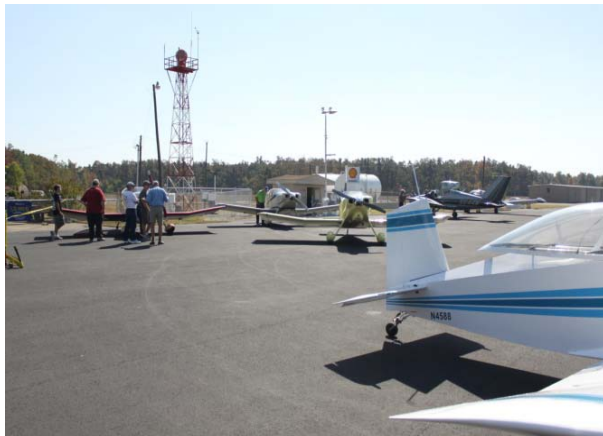
Stomachs full, fuel up! It's time to ...