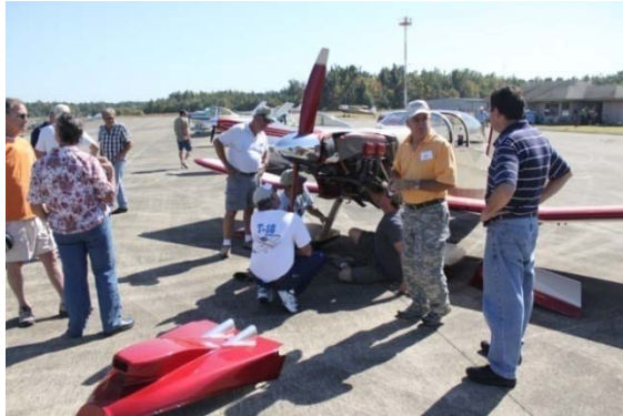
The crowd gathers

advantage to having problems in the midst of a group of Thorp experts.