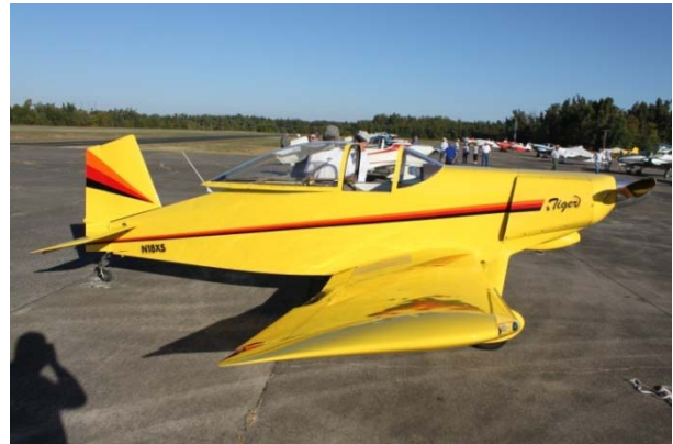
Bernie Fried N18XS

good reason to hit the airport as soon as possible.