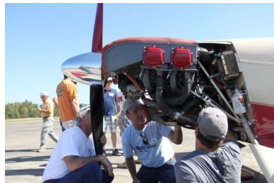
Can you hand me a ...