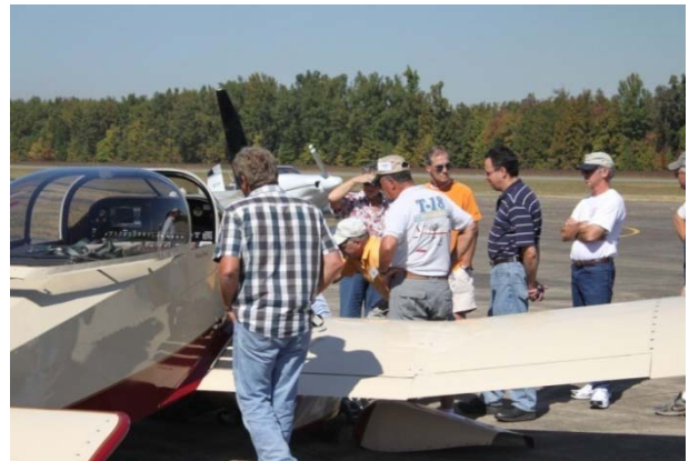
Pulling the cowl, draws a crowd like ringing the dinner bell!