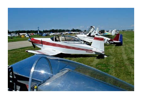
N589LW in the Homebuilt Review, behind a Rocket and in front of the RV's, good position!

Tuesday David Read joined me in the airplane and we were off for some ground shots followed by some air-to-air work over Lake Beautimore. I'm not sure when those pictures will grace the pages of Sport Aviation but you can bet I'll let you guys know.