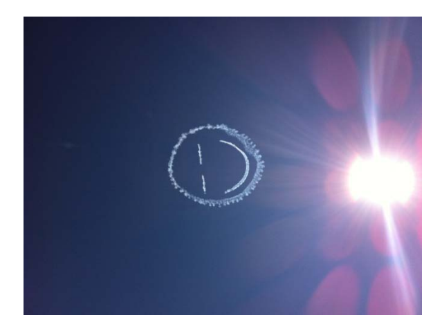
This just about sums it up! Oshkosh 2011 was a great year!

Outstanding Workmanship Award going to one of us. All in all a great year, a hard one to beat!