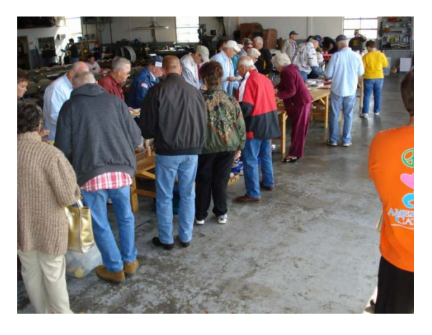
All in line for Fish! (And just about every side knew to man!)