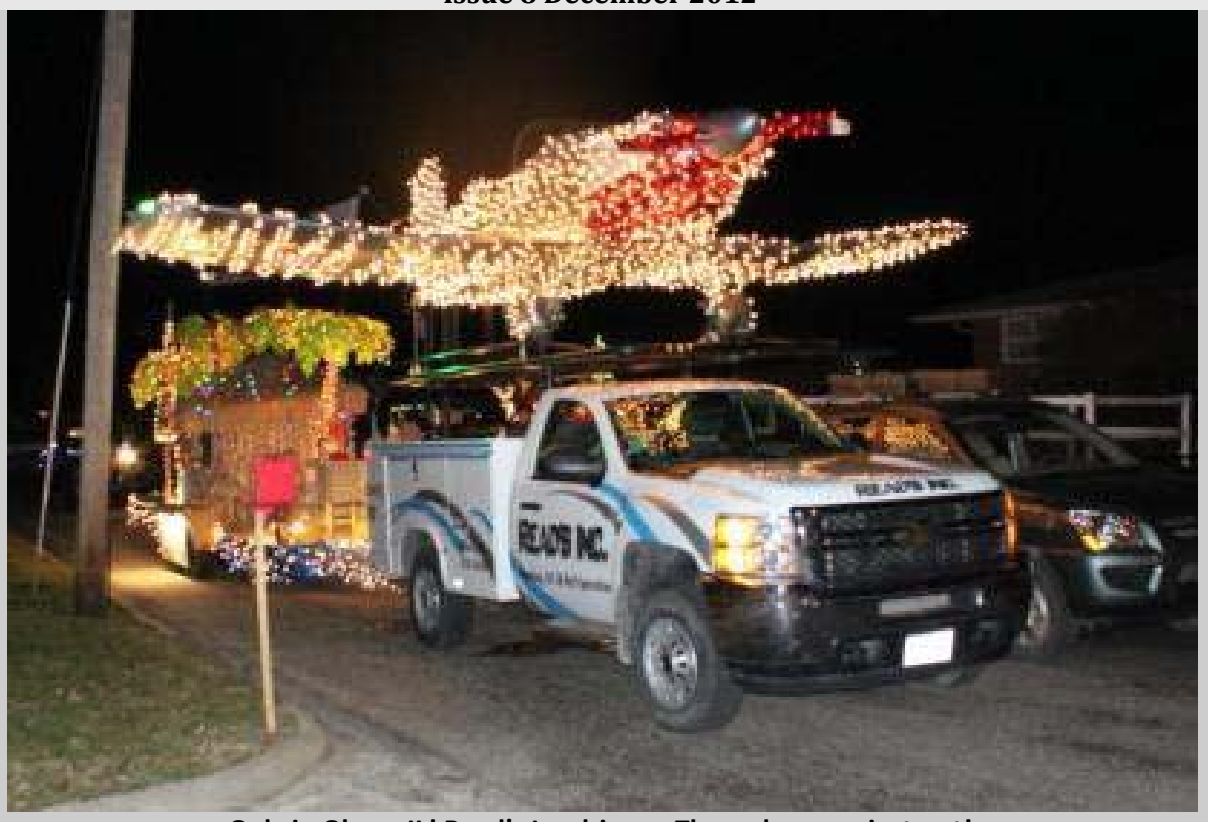
Only in Olney, IL! Read's Inc drives a Thorp down mainstreet!