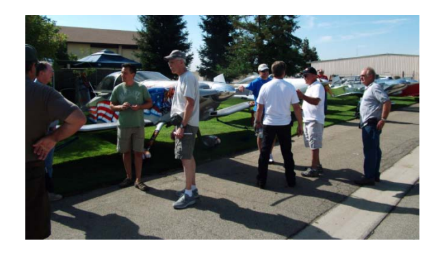
Another Thorp related pow wow