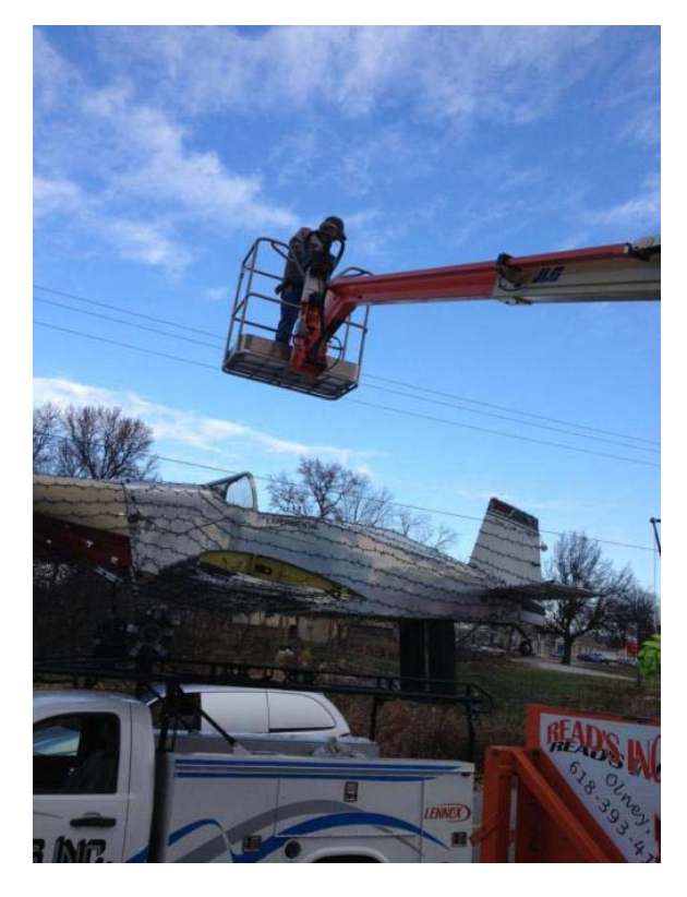
Taking it down ... this was no small task! Of course I'm sure putting it all together was worse!

Quick "Thorp Racer" update - Jim "Cubes" Grahan