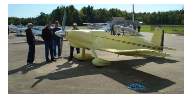
Gary Green holding court (more likely a FW forward discussion) around NX218V