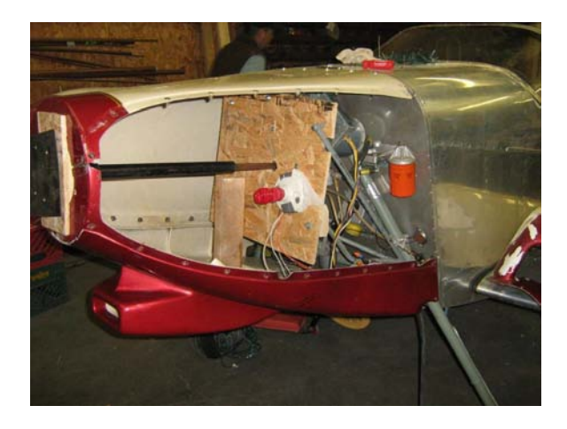
Dave installed a fridge motor and hung a "prop" also red lights shining out the cowl intakes.