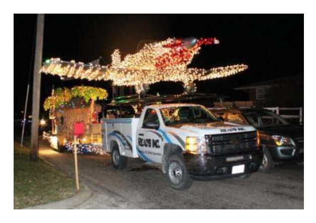
Another angle, over 600 lights on the Thorp, and yes the prop was turning!

The entire float, Thorp on the roof of the truck pulling a banner "Special Delivery from Read's Inc.", then a float depicting a "paradise island" with the quote "Even an island paradise needs Air Conditioning" finally pulling a John boat on wheels with a functioning tiller (spare Thorp Tail wheel) with the quote "Read's Inc going the extra nautical mile"