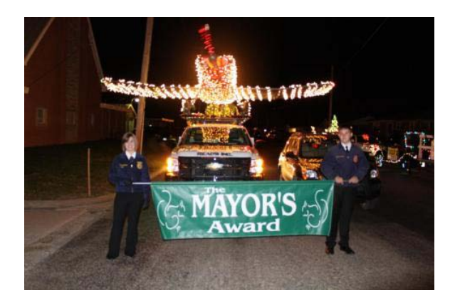
Won the Mayors Award